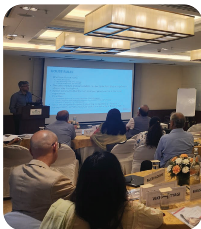
Glimpse of workshop in action

TIF's Municipal Finance Champions Lab on Integrated Wastewater Management and Circularity brought together various stakeholders to address the challenges and explore solutions in wastewater reuse. Held at the India Habitat Centre, the event focused on institutional capabilities, policy frameworks, technological innovations, financial models, and the integration of treated wastewater into irrigation networks, economic strategies, capacity building, and research to enhance wastewater management practices. By implementing comprehensive recommendations, stakeholders can significantly improve the sustainability and scalability of wastewater reuse initiatives, thereby contributing to water conservation and environmental protection. The Lab was held in collaboration with the World Bank and several officials from the departments concerned in states. TIF and World Bank have planned another workshop to be announced soon.